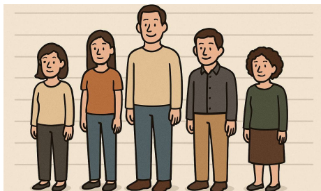
Within-group variation: 30yr old Heights

Within each age group, people have different heights: within-group variation , E(\text{Var}(Y|X)) .