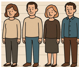
No within-group variation

To predict height based on age alone, ideally everyone within an age group would have exactly the same height, while different age groups had different heights. Then, given someone's age, we would be able to predict their height perfectly.